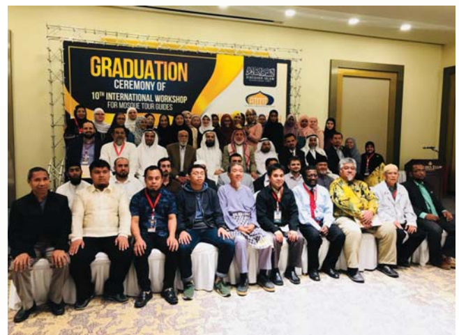
▲ Graduation Ceremony of the ATMT workshop.