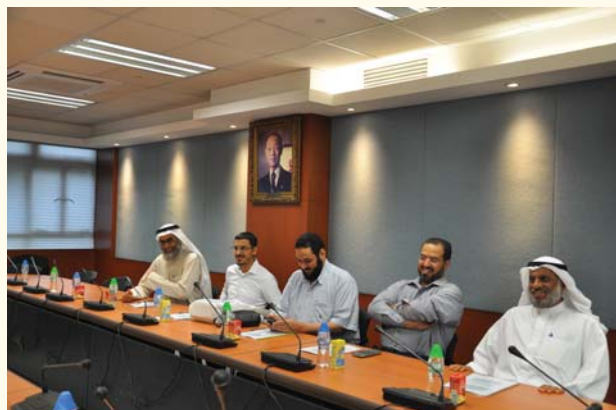
▲ 代表團參觀訪問香港中文大學伊斯蘭文化研究中心

下午代表團前往香港中文大學伊斯蘭研究中心參觀，結束參觀後由香港伊斯蘭文化協會在九龍城宴請代表團。