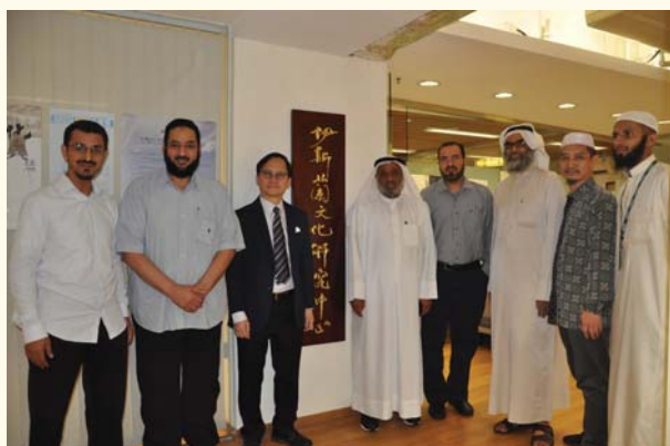
▲ The delegation visited Centre for the Study of Islamic Culture, CUHK.

The delegation met Council members of the Islamic Union of Hong Kong (the Union) on the morning of Saturday, 21 October 2017 during which a paper on da'wah and charitable work undertaken