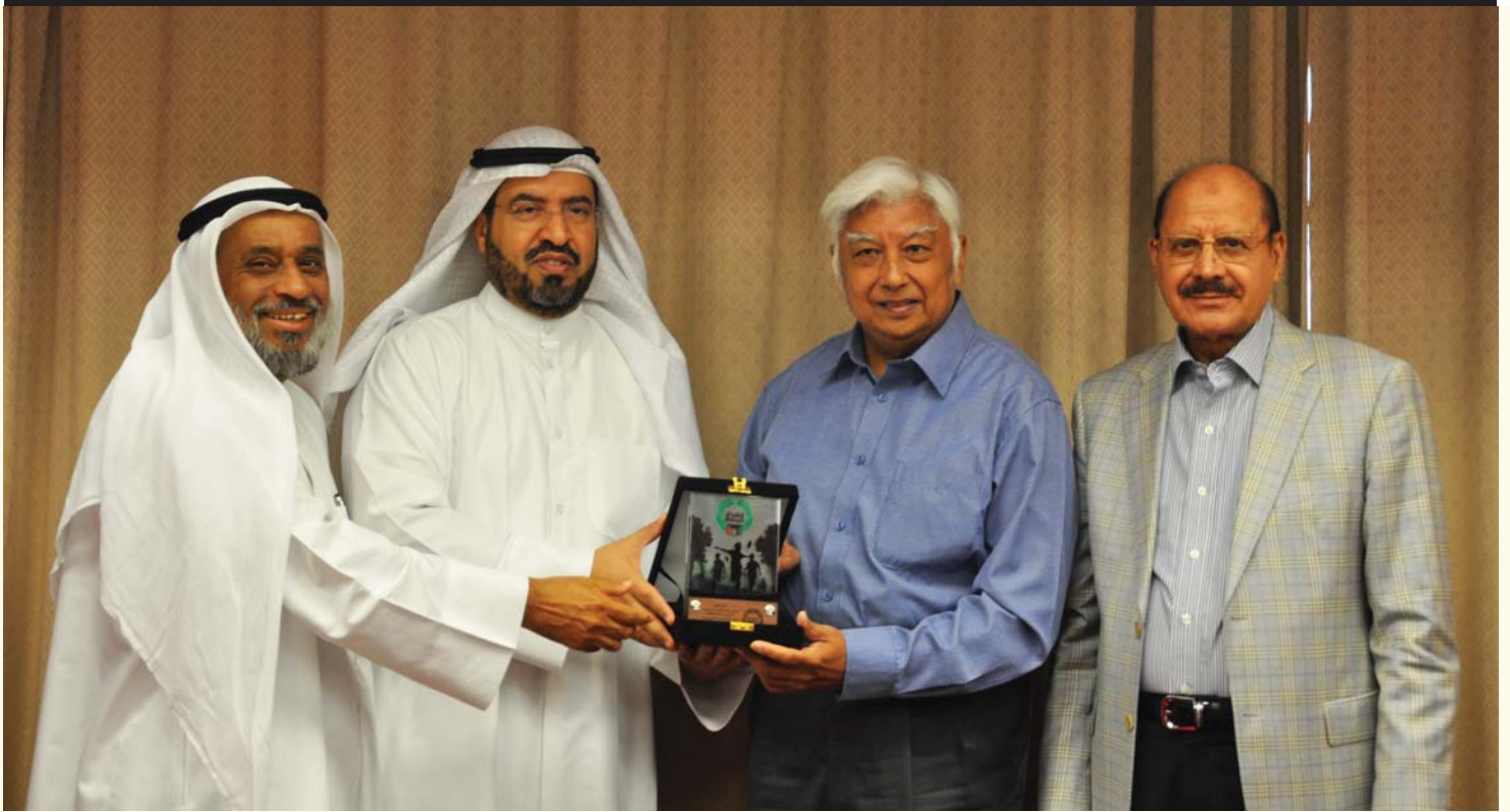
▲ The delegation presented a souvenir to the Islamic Union.

Address: Masjid Ammar & O.R.Sadick Islamic Centre, 40 Oi Kwan Road, Wanchai, Hong Kong E-mail: info@iuhk.org Website: www.iuhk.org Contact: (852)34699205 Fax: (852)28345409