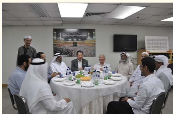
▲ The Chinese Muslim Cultural and Fraternal Association hosted a lunch for the delegation.

The delegation met the Principal and staff members of the Islamic Kasim Tuet Memorial College on the following day to discuss various projects. After Jumma, the delegation were guests at a lunch hosted by the Chinese Muslim Cultural and Fraternal Association, following which they visited the Chinese University of Hong Kong. That evening the Islamic Cultural Association hosted a dinner for them at a restaurant in Kowloon City.