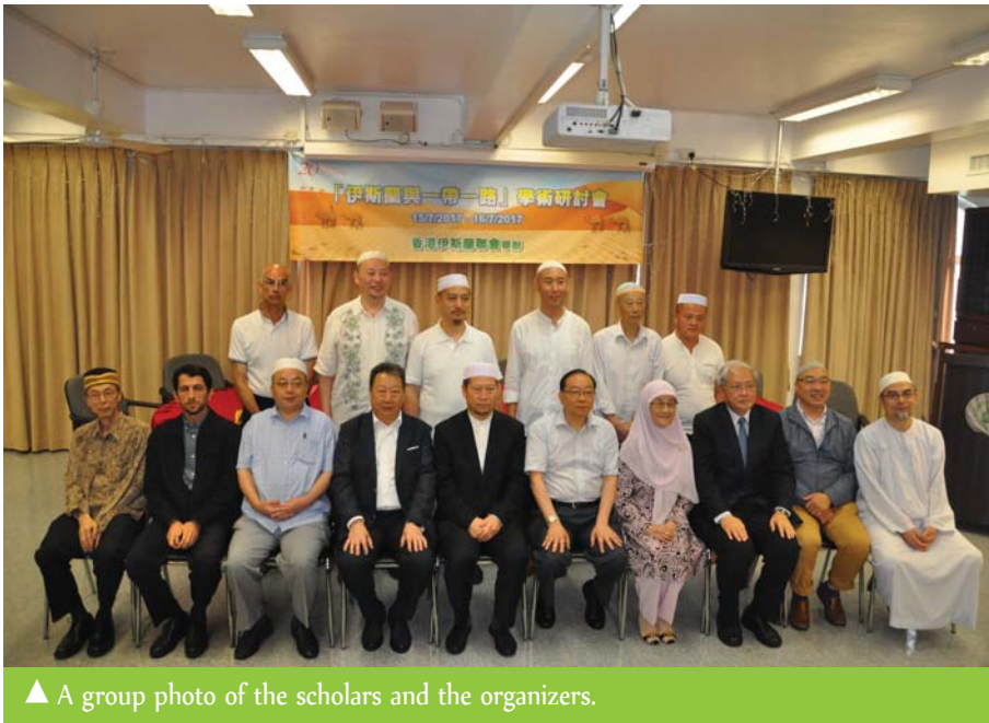
▲ A group photo of the scholars and the organizers.

As part of events celebrating the 20th anniversary of the handover of Hong Kong to the People's Republic of China, the Da'wah Committee of the Islamic Union of Hong Kong (the Union) organized a seminar on "One Belt, One Road – An Islamic Perspective".