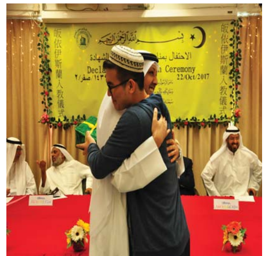
▲ The converted brother warmly hugged the Consul General.

“So what we understand from this story is that whatever happen to those who believe in Allah and have faith in Islam they might go through some tests and difficulties but they have to stay firm on the path of Allah.”