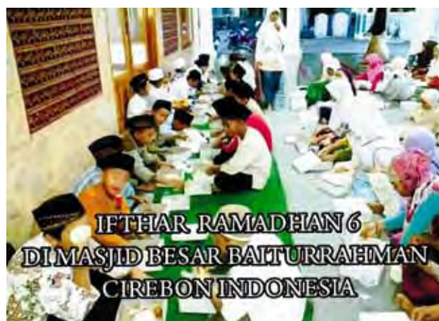
Iftar in Indonesia