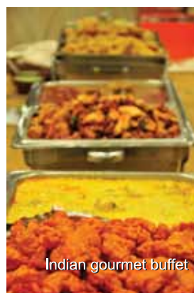
Indian gourmet buffet