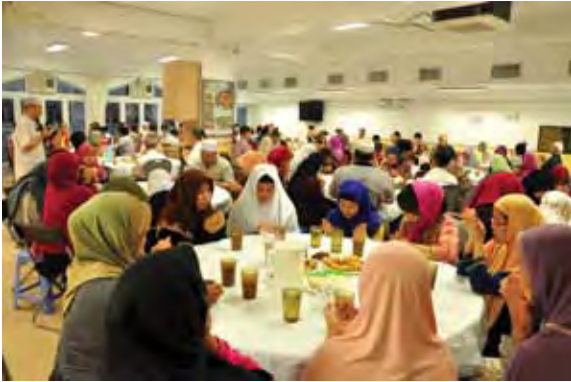
Iftar at 5/F Canteen

The Union, as in previous years, organised 'Iftar' meals to brothers and sisters who were fasting during the holy month of Ramadhan.