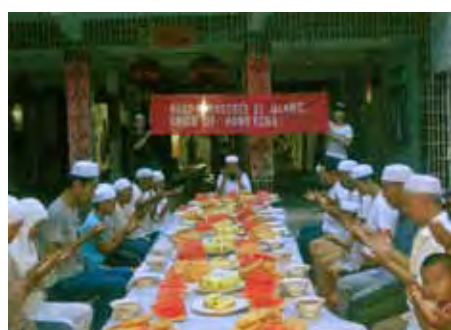
Iftar in Henan, China