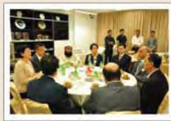
入境事務處代表、中聯辦代表及各國駐港領事