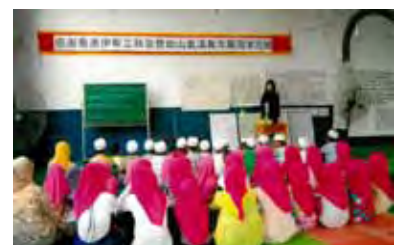
Students having class