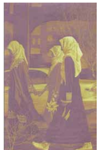
Xylographic Works of Luo Guirong