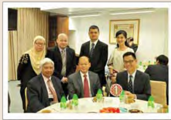
伊聯會主席，石輝兄弟（前排左一），香港警務處處長，曾偉雄先生（前排左二）與灣仔警區指揮官，李永光先生（前排右一）