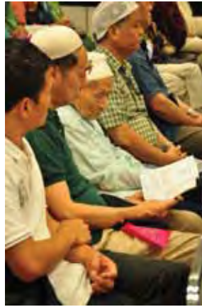
當中不乏資深穆斯林