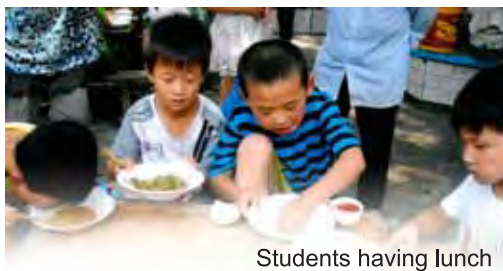
Students having lunch

The Union has sponsored a mosque in Shandong Province in East China to organise a summer course on Islam for children. More than 50 boys and girls aged between 6 and 15 years attended the month-long course.