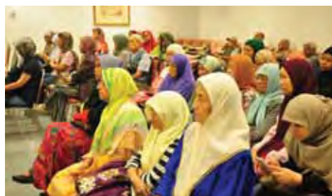
Brothers and sisters attending the Fatihah

Organised jointly by the Union's Da'wah and Welfare Committees, the function was held in the seminar room on the 6 floor of Masjid Ammar and Osman Ramju Sadick Islamic Centre and attracted more than 150 participants.