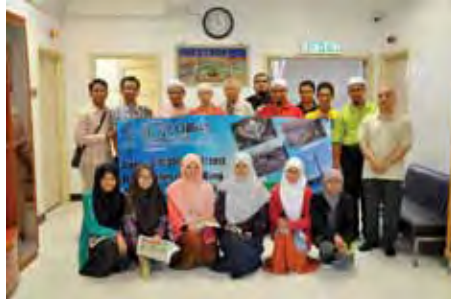
Students from Malaysia