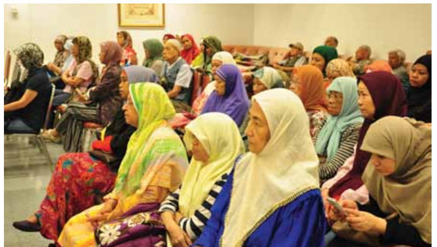
教胞們參加法諦哈