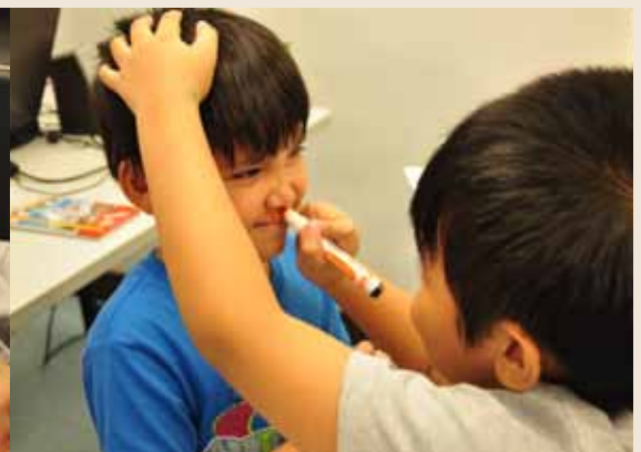
參加手工活動的孩子們