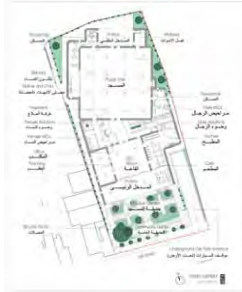
Plan of Cambridge Mosque

There are approximately 1,000 Muslim students and faculty members in Cambridge. To this number must be