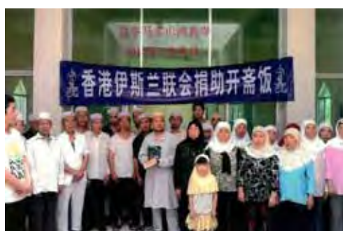
Iftar in Sichuan, China

In Henan Province, China, the Union remitted HK$ 31,600 for distribution to four masjids for iftar. A total of 91 men, 89 women, 15 children and 6 widows, while in Sichuan Province, a total of 910 Muslims comprising of 405 men and 302 women benefitted from HK$ 27,000 donation.