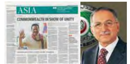
《南華早報》相關報道 Ekmeleddin Ihsanoglu

世界最大的伊斯蘭國家聯盟秘書長表示：當他訪問長期受迫害的羅興亞穆斯林社區時，他了解到生活在那兒的穆斯林們在緬甸佛教暴徒和城管的逼迫下背井離鄉，這使他黯然淚下。“我從未有過這樣一種感覺，”Ekmeleddin Ihsanoglu說，他和伊斯蘭合作組織代表團的其他成員訪問緬甸期間，曾與緬甸總統會面交談，在結束了為期三日在緬甸的訪問後他表示，最讓他印象深刻的便是一大群哀愁的人們生活在Rakhine州首府Sittwe城外一片遍地垃圾的營地裏。Ihsanoglu說：“我當時就哭了。”