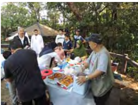
Volunteers distributing lunch to children

It was a beautiful day when around 50 boys studying Qu'ran at the Masjid Ammar and O.R. Sadick Islamic Centre took time off and went on an outing in Sai Kung.