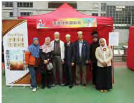
First Row: Indonesian sisters performed folk dance in the Wan Chai District event; Second Row Left: Brother from Philippines doing street Da’wah in Central; Second Row Right: Volunteers in front of the booth of the Union.

Fifteen Filipinas embraced Islam recently when two brothers, skilled in da’wah, were in Hong Kong to propagate Islam to non-Muslims.