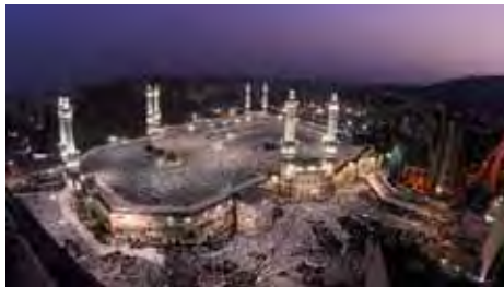
Al-Masjid Al-Haram, Mecca

experience of holding on to a new suitcase in front of the massive clock tower building in Mecca and stranded among people doing their Maghrib prayers in the open air in front of Al-Masjid Al-Haram is something we will always remember. The grounds around the Masjid were filled with people who slept the night and at other times during the main prayer times performing their praying. Kaaba was jammed with people almost around the clock, as we were there several times of the day and in many days.