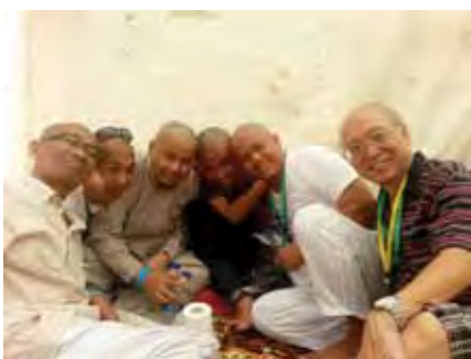
伊聯會朝覲團團員在麥加