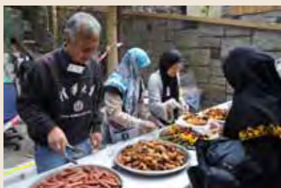
Volunteers delivering lunch to participants