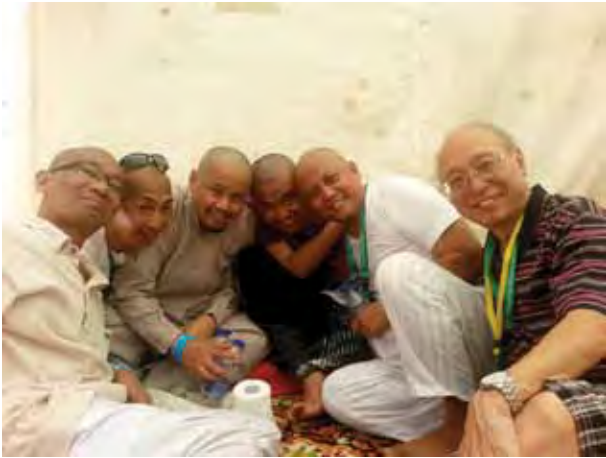
IU Hajj Group members in Mecca