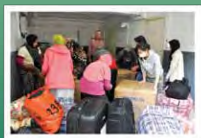
Packing the relief supplies