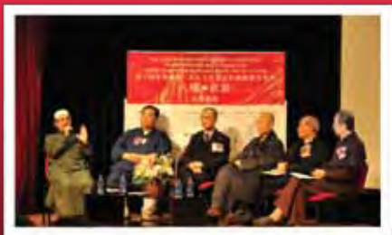
五大宗教代表齊聚一堂