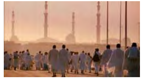
Street View of Mecca

Only during the Hajj trip one gets the feeling and reason of how five prayers a day can be dutifully carried out. Even shops and government service are closed when prayer times are called. On the other hand, one feels somewhat overwhelmed by the large number of people who had to sleep overnight on the street, in open squares, or wherever they might find. Overnight accommodation was simply unable to meet demand. There were also many beggars where crowds abounded. Many, I was told, came from as far as Africa, knowing pilgrims were ready to give alms to the poor. In all, it was a trip that has brought many thoughts and new experience to us that are precious to us as Muslims and as the first steps to understand Saudi Arabia.