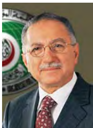
Ekmeleddin Ihsanoglu, Prime Minister of Turkey

The secretary general of the world's largest bloc of Islamic countries said emotional visits with members of the long-persecuted Rohingya Muslim community – chased from their homes in Myanmar by Buddhist mobs and arsonists – brought him to tears. "I've never had such a feeling," Ekmeleddin Ihsanoglu said, as he and other delegates from the Organisation of Islamic Co-operation wrapped up a three-day tour to Myanmar that included talks with its president. He said it was the huge, emotional crowds living in rubbish-strewn camps outside the Rakhine state capital, Sittwe, that made the biggest impression. "I was crying," Ihsanoglu said.