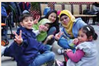
Participants enjoying a good time

It was a warm sunny day when a group of nearly 200 brothers and sisters, old and young took part in the 'BBQ' event organised by the Union's Sports & Recreation Committee at the Chai Wan Masjid during the seasonal holidays.