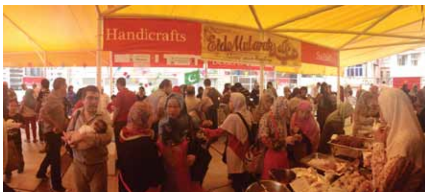
Left: Children were quite interested in the chocolate fountain; Right: Large crowd of brothers and sisters attended the event

Supported by the Union, the two-day International Food Festival celebrating Eid-El-Adha came to a close with great success.