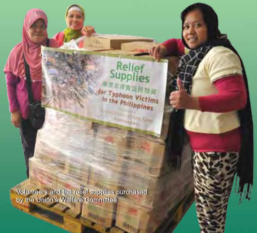
Volunteers and the relief supplies purchased by the Union's Welfare Committee