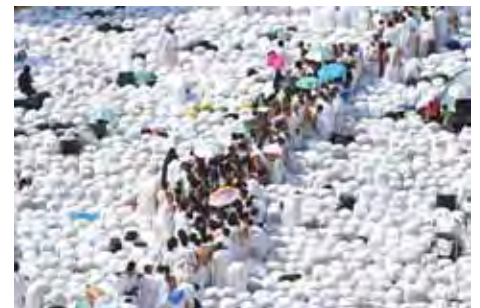
Crowd inside the Al-Masjid Al-Haram

valued for its views and water access. The Floating Mosque, strategically located along the waterfront, was the most impressive building we visited in Jeddah.