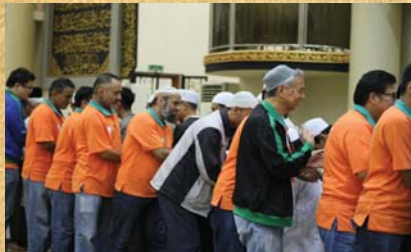
Rashidah Sa'adatul Bolkiah Mosque