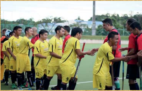
Youth friendly match 青年友誼賽