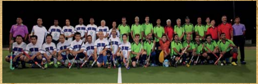
Veteran friendly match 老手友誼賽