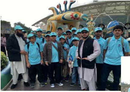
12 December 2015 Ocean Park 2015年12月12日 海洋公園