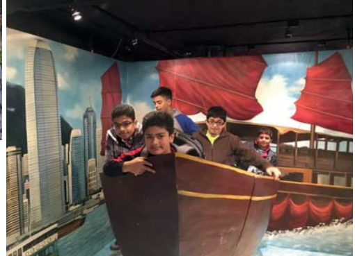
2016年1月30日立體攝影及香港科學館 30 January 2016 3D Studio and Science Museum

The Union wishes to express its appreciation to the Hong Kong Police Force Wan Chai Division for organizing the Madrassah outings.