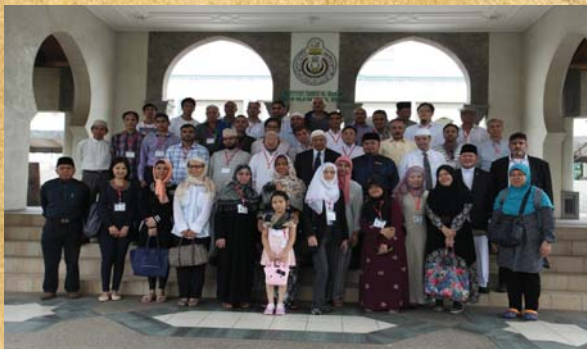
Institut Tahfiz Al-Quran Sultan Haji Hassanal Bolkiah 經學院