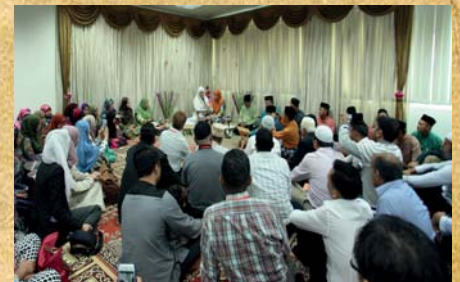
Dakwah Centre 宣教中心