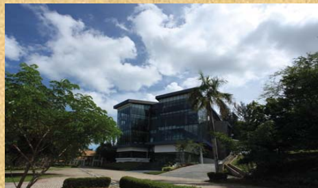
University of Brunei Darussalam 汶萊大學