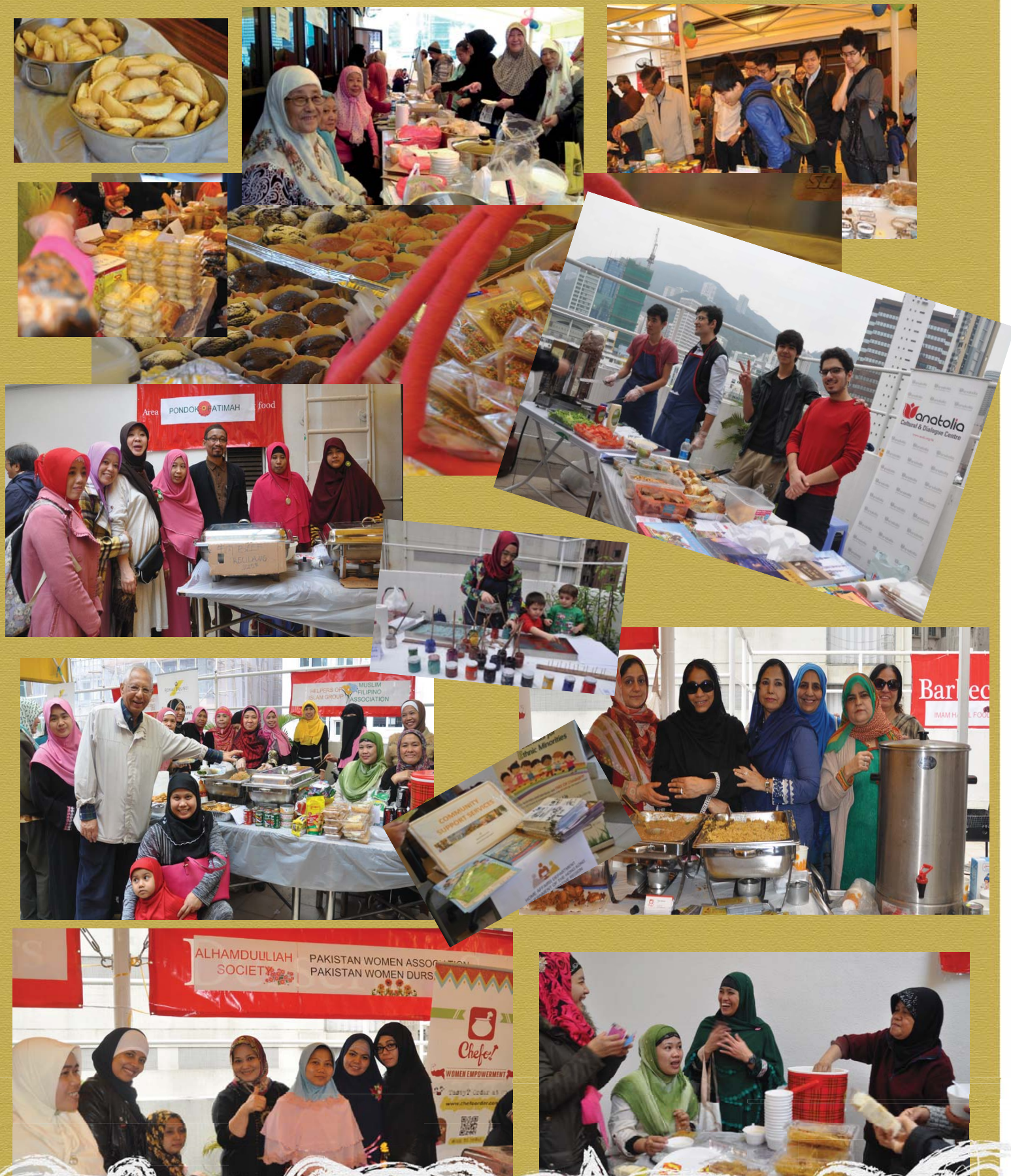
27 Dec. 2015 Int'l Charity Food Fair photo album