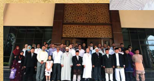
Mufti Office 伊斯蘭法學顧問辦公室