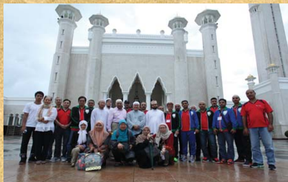
Omar Ali Saifuddien Mosque