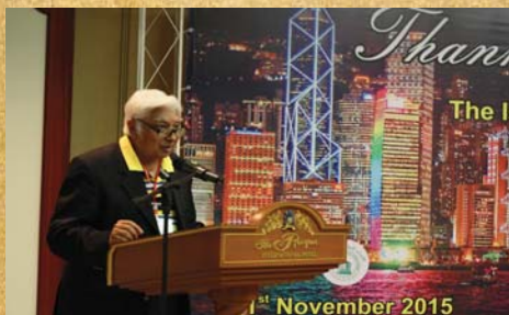
Thank You Dinner at Rizqun International Hotel 感謝晚宴