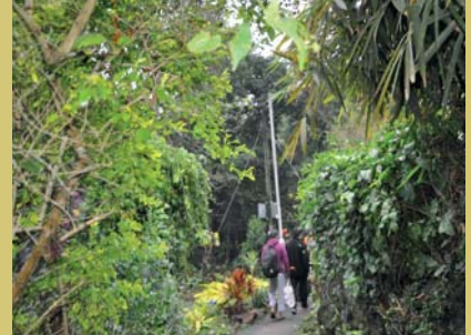
2016年1月16日 西貢荔枝莊遠足 16 January 2016 Sai Kung Lai Chi Chong Hiking organised by Sports & Recreation Committee 體育及康樂委員會主辦